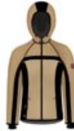
[P] Cappucino Beige/Black