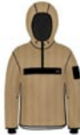
[P] Cappucino Beige/Black