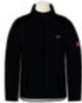
[C] Storm Blue/Black