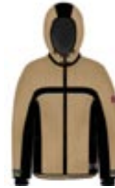
[P] Cappuchino Beige/Black